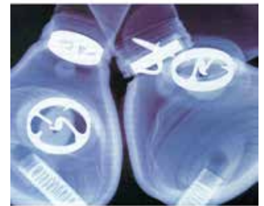
SynCardia Total Artificial Heart